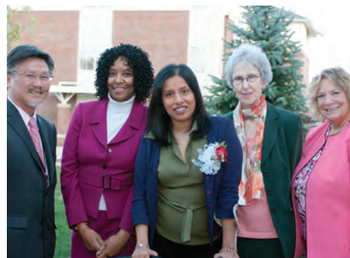
▲ ALUMNI REUNION