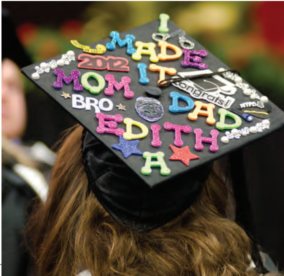
< 2012 The graduating class of 504 students is the largest in College history.