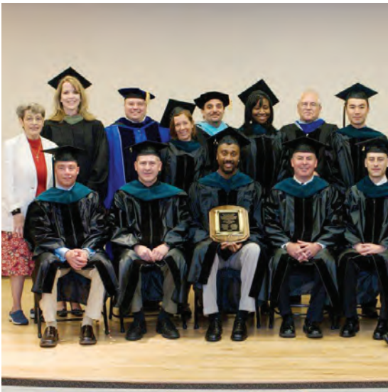
^ 2009 The first class of DPT students graduate.