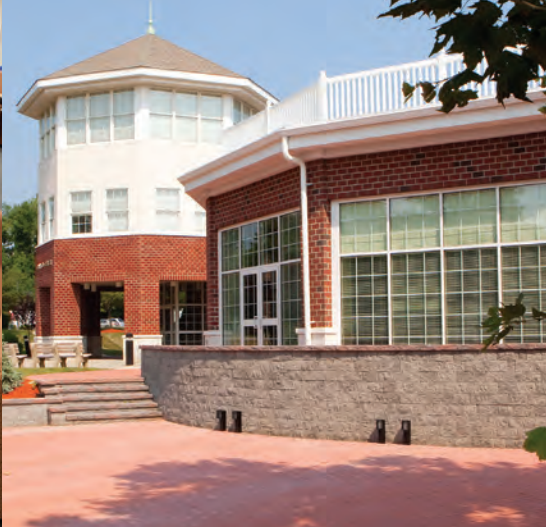
^ 2011 The Granito Center is expanded to provide additional space for students.