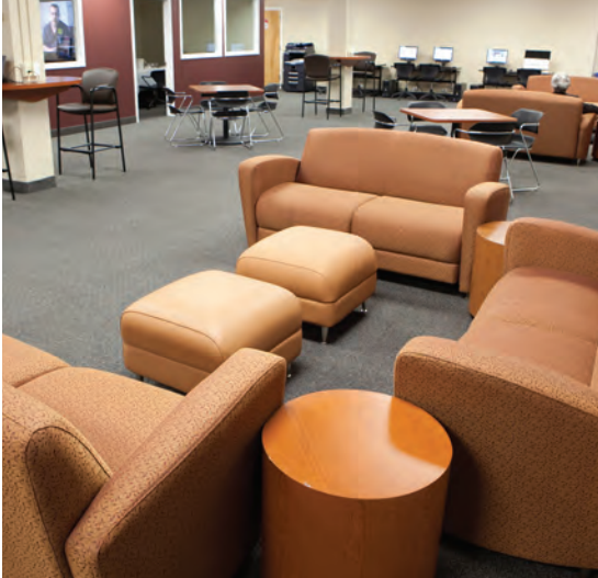
2011 > The Learning Commons opens in the Sullivan Library.