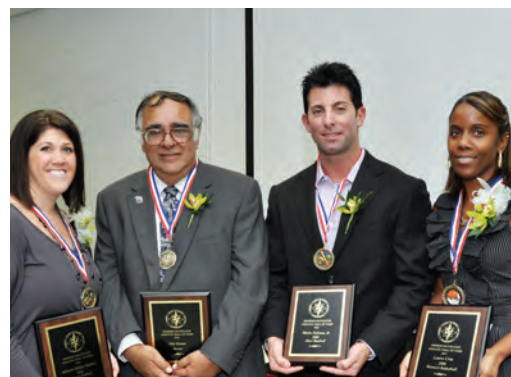
▲ HALL OF FAME INDUCTEES

The Alumni Hall of Achievement was inaugurated in 2007 to recognize commitment and dedication to the College and the community. @