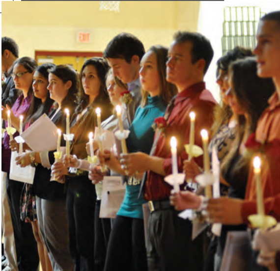
< 2009 National Honor Societies for Biology and Criminal Justice are established on campus.