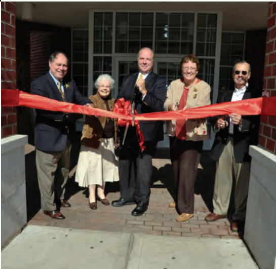
2010 > A capital campaign, Advancing Excellence, is launched to help provide a promising future for the College's growing student body.