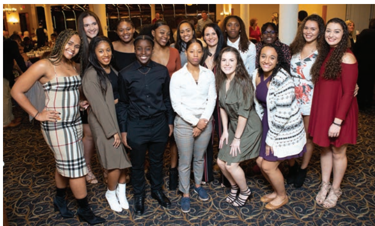
Women's basketball team