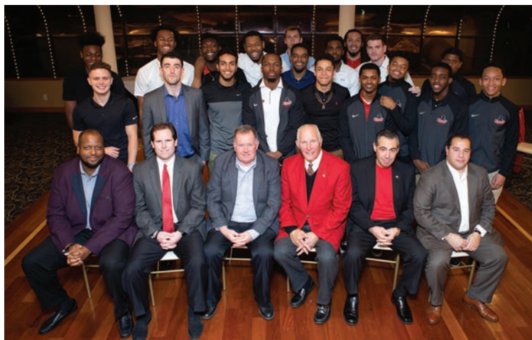
Men's basketball team