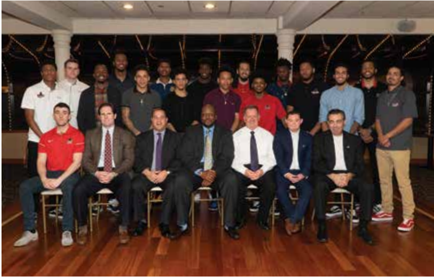
Men's basketball team