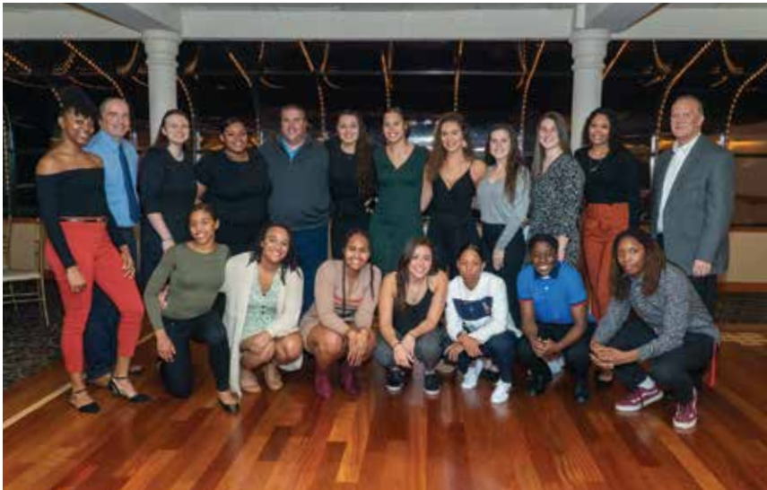
Women's basketball team