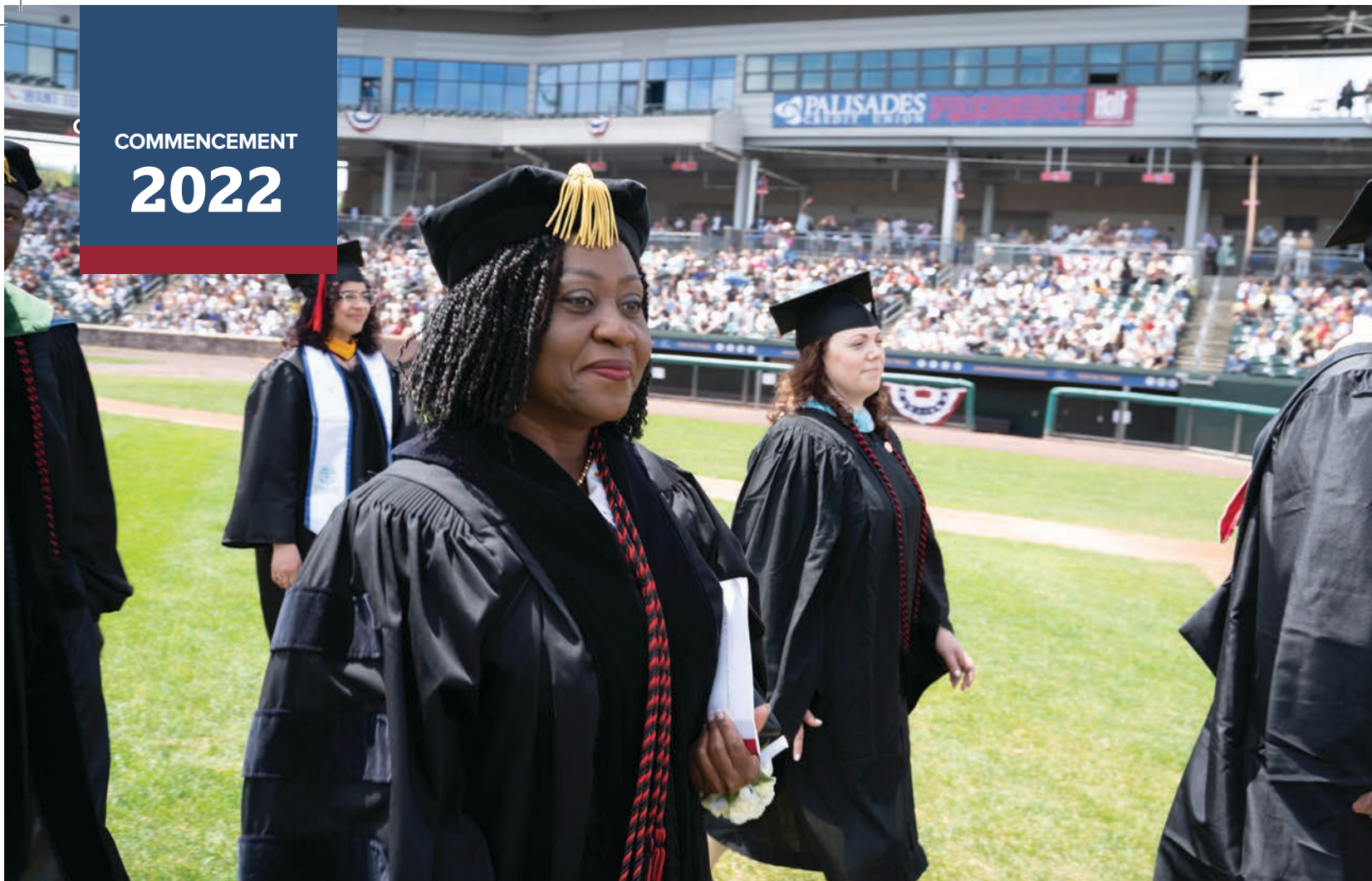
Commencement Speaker Martha Ama Akyaa Pobee during the procession into Clover Stadium.