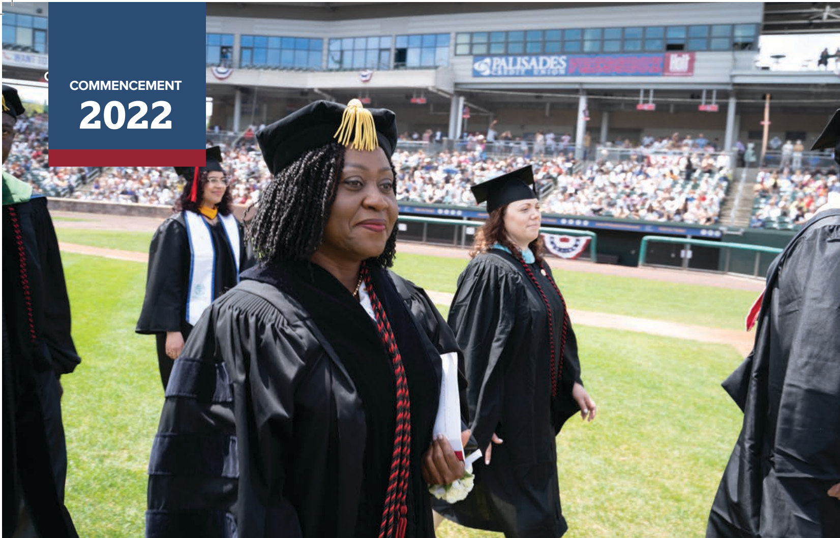
Commencement Speaker Martha Ama Akyaa Pobee during the procession into Clover Stadium.